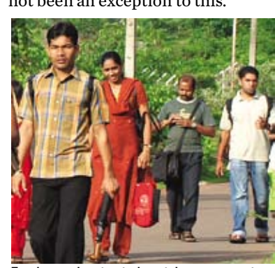
Employees leaving industrial estate premises

PANAJI: The global \, melt down \, which \, started \, in \, the \, Western \, countries \, slowly brought almost the entire world into its grasp and Goa has